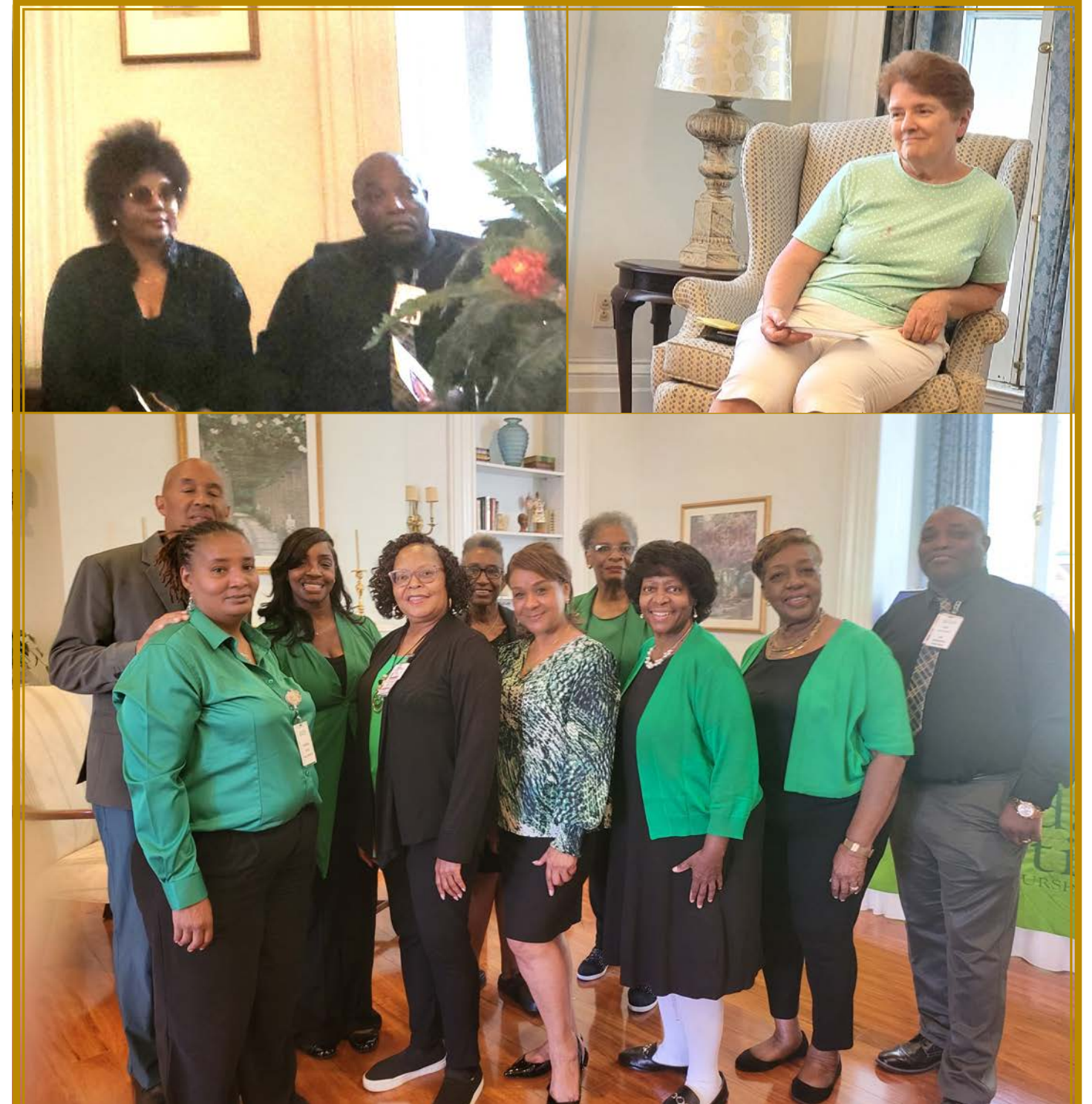
Stoddard Baptist Nursing Home Staff Members