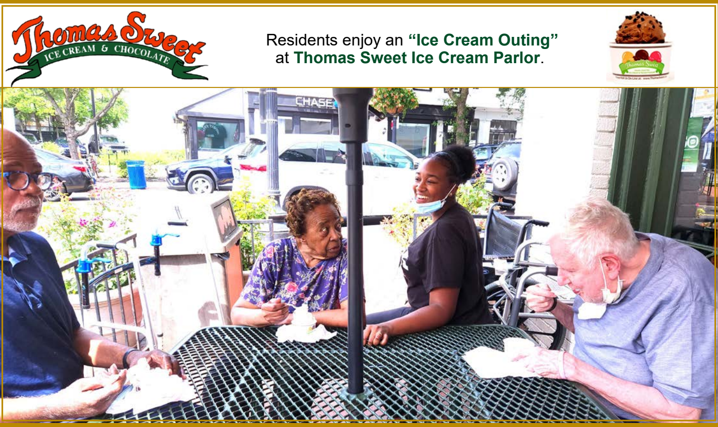
Residents enjoy an “Ice Cream Outing” at Thomas Sweet Ice Cream Parlor.