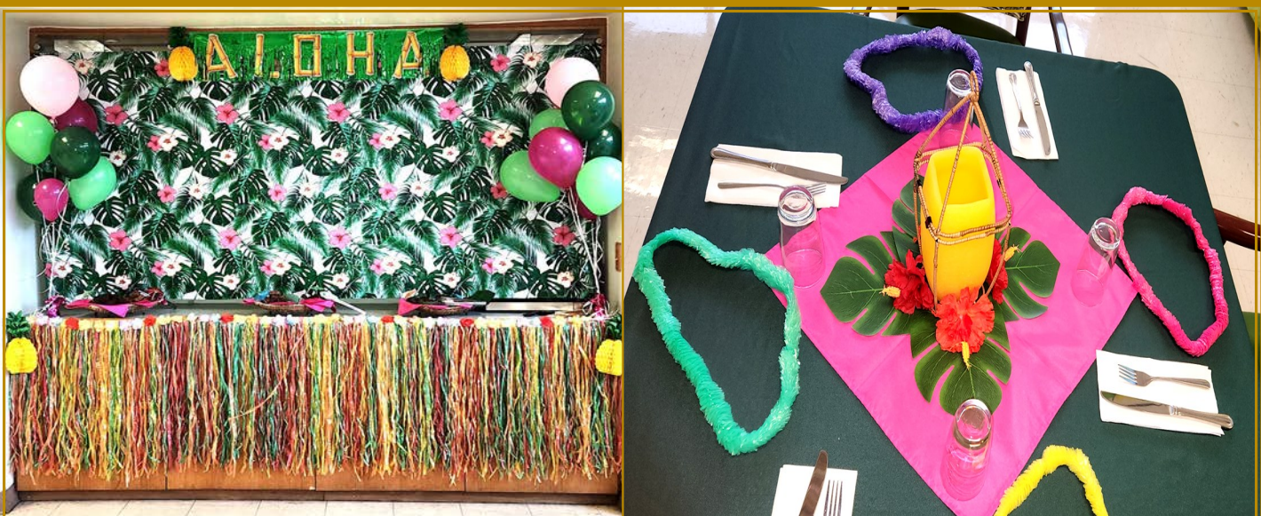
The dining room is beautifully decorated by staff for “Tropical Family Night Dinner”.