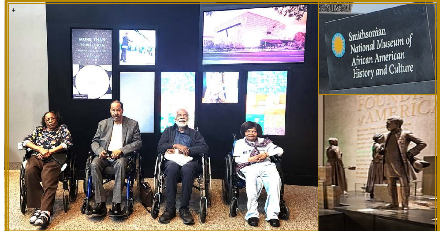
Residents enjoy their visit to the Smithsonian National Museum of African American History and Culture .