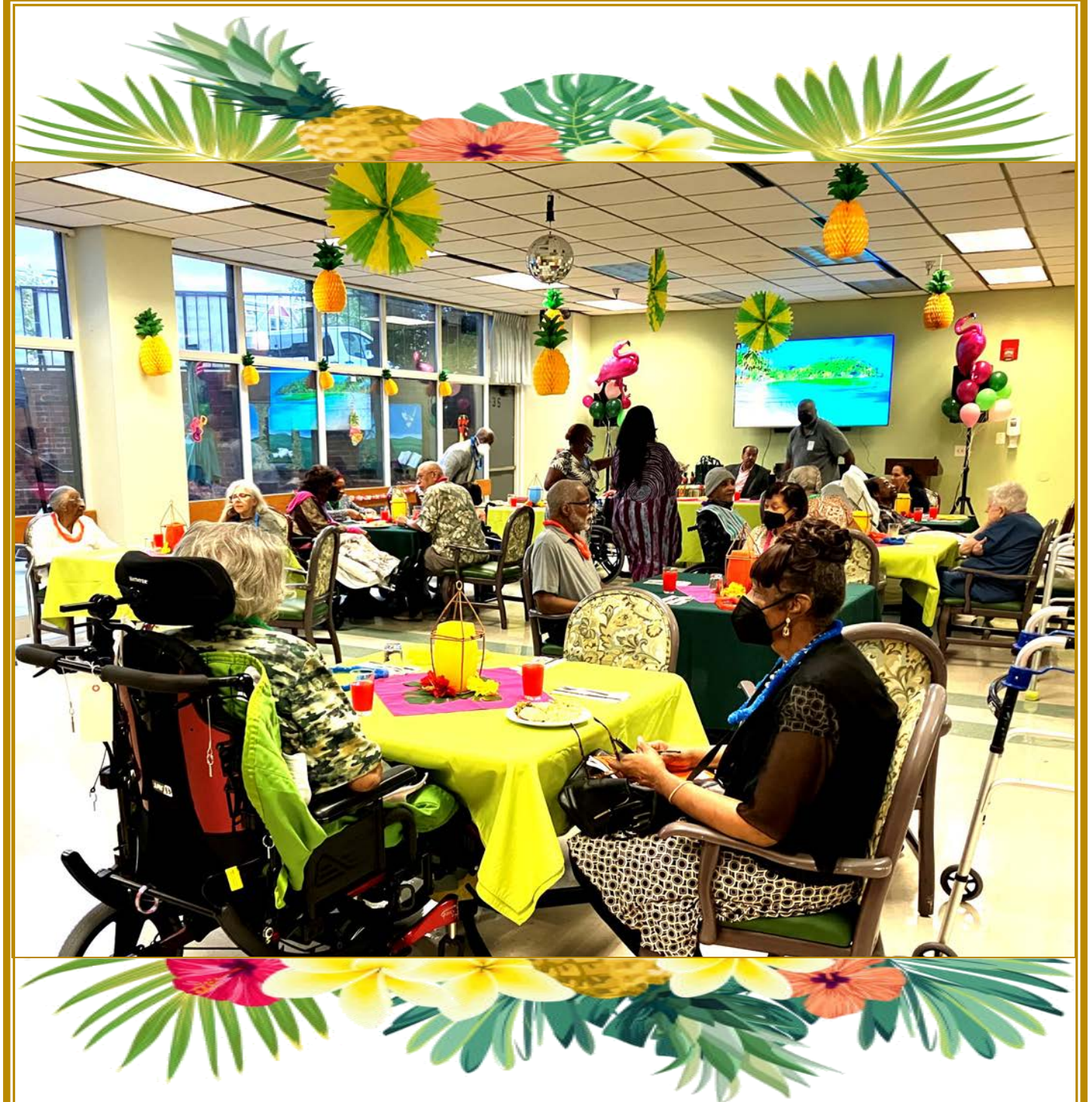
Residents enjoy a delicious meal and fellowship at “Tropical Family Night Dinner”.