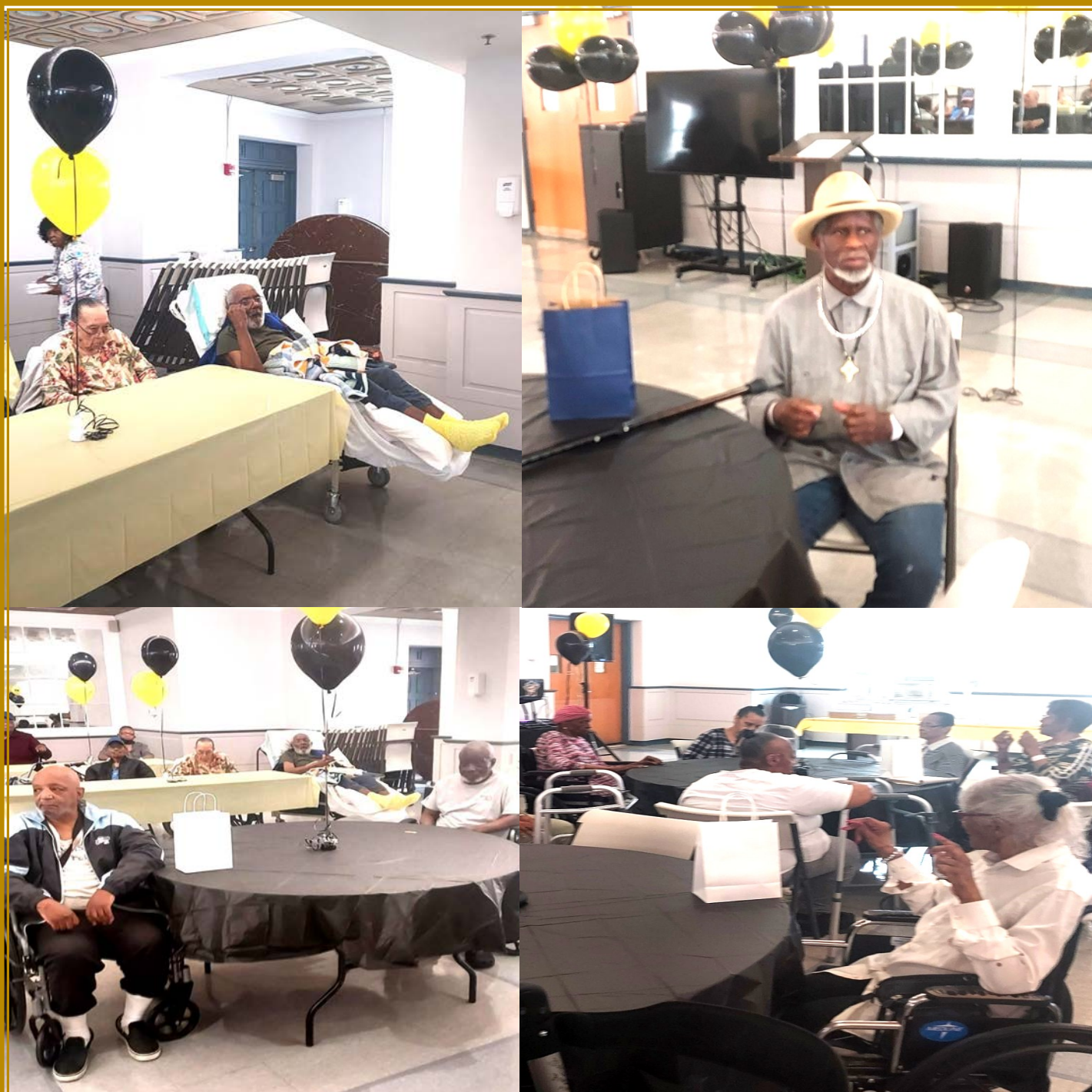
Residents enjoy wonderful refreshments and fellowship during “End of the Summer Blast” .