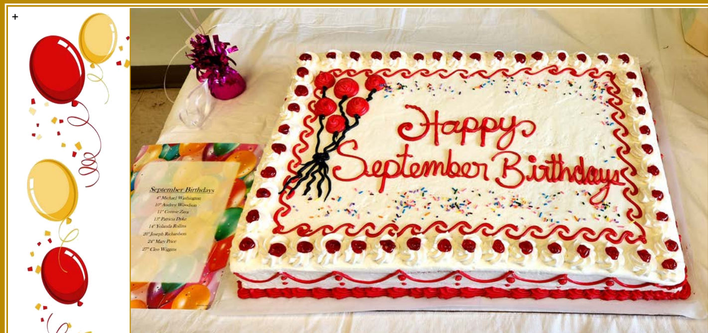
For September (and all months), the “Monthly Birthday Celebration” was held for residents to celebrate their birthdays.