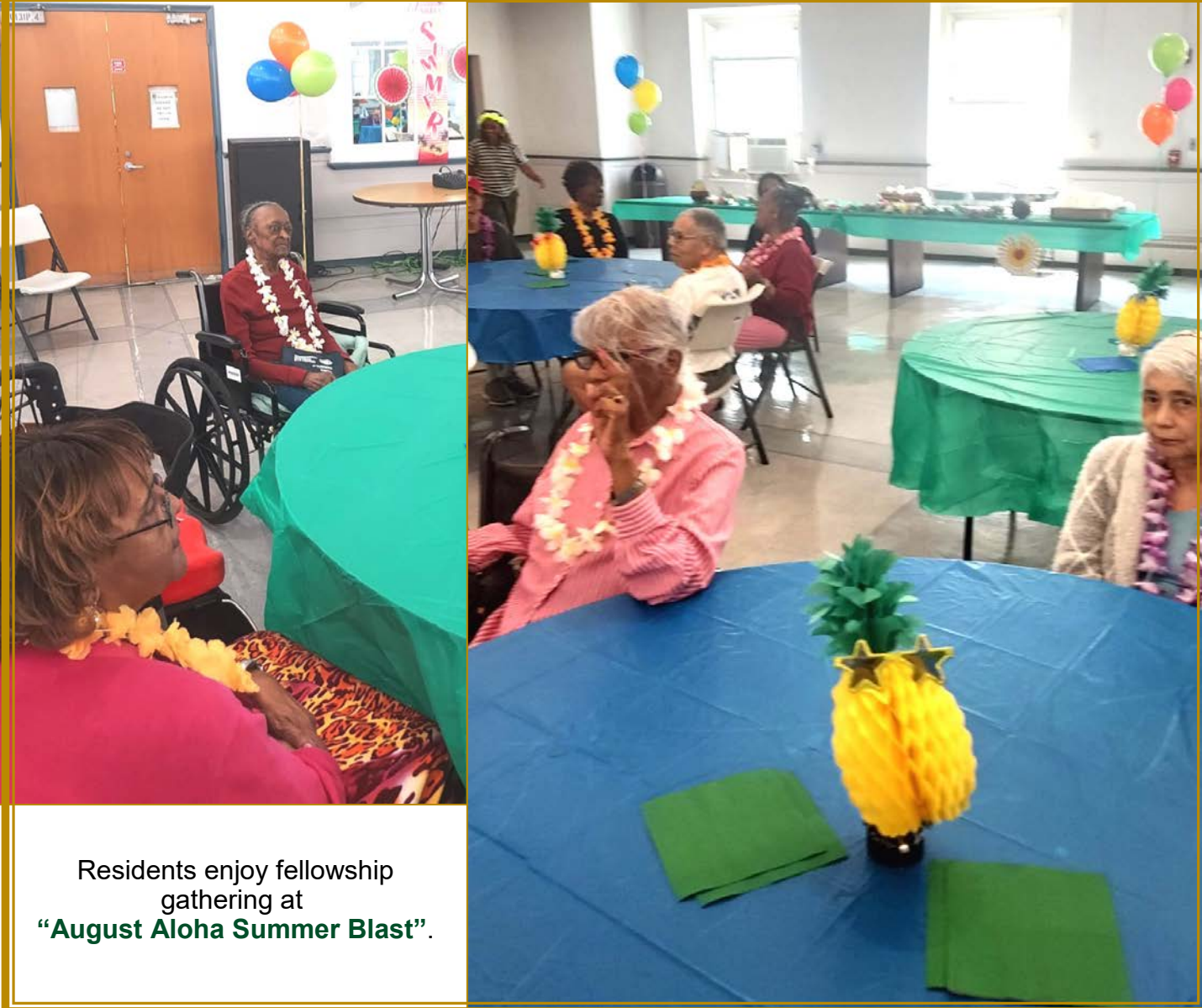
Residents enjoy fellowship gathering at “August Aloha Summer Blast”.