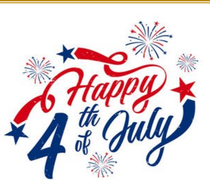
Residents enjoy “Fourth of July Jam” Time.