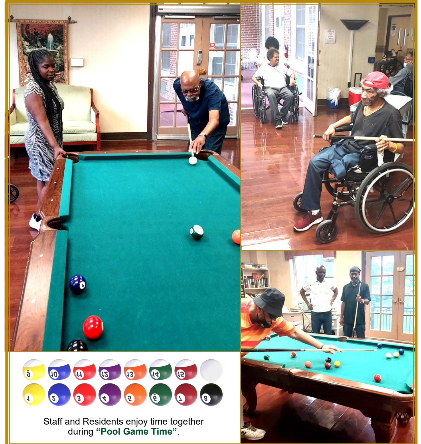
Staff and Residents enjoy time together during “Pool Game Time”.